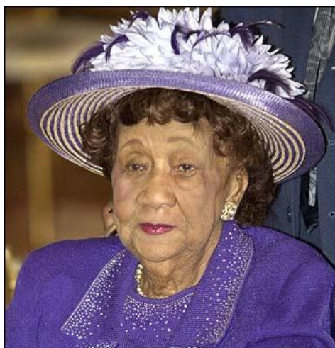
Dr. Dorothy Irene Height

(March 24, 1912 – April 20, 2010) American administrator, educator, and social activist.